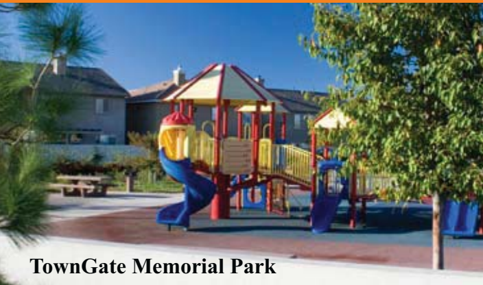
TownGate Memorial Park

City of Moreno Valley Parks and Community Services Department Parks Maintenance Division 15670 Perris Boulevard Moreno Valley, CA 92552-0805 951.413.3702