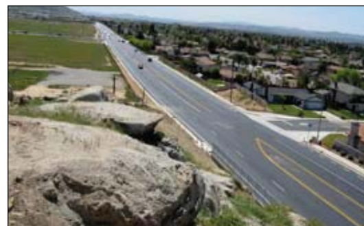
A look at the improvements to Lasselle Street.

To accomplish the road widening, an existing 500 foot long steep rock mountain had to be cut back by 30 feet. Traditionally, such a challenging undertaking requires blasting with explosives but it was further complicated by the presence of 150 plus homes within a ¼ mile radius and two adjacent high pressure gas pipelines. To avoid the potential complications of using explosives, the project team decided to take an innovative rock removal and stabilization method. The team of geologists, engineers and rock construction specialists successfully removed more than 165,000 cubic feet of the rock mountain back and installed 34 rock anchors to secure the rock mass that remained. The project was completed ahead of schedule and under budget.