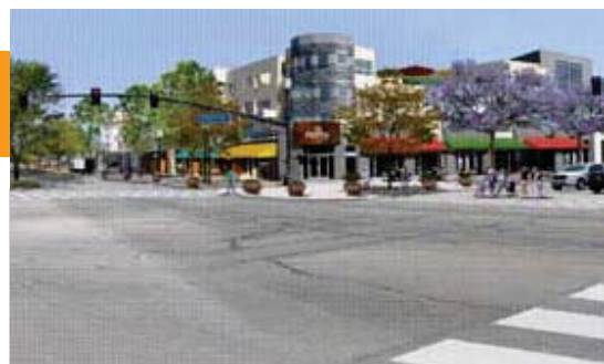
Potential Alessandro Boulevard Improvements

For more information visit the Neighborhood Preservation Division of the Economic Development Department at www.moval.org , call us at 951.413.3450 , or email us at np@moval.org .